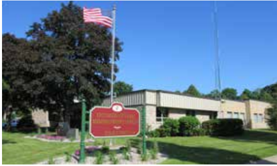
1. Tecumseh City Hall/ Building Dept. Police Department P.O. Box 396 • 309 E. Chicago Blvd.