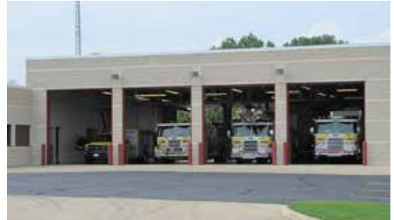
2. Fire Department 101 E. Russell Rd.