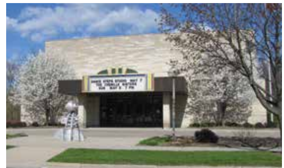
4. Tecumseh Center for the Arts 400 N. Maumee St.