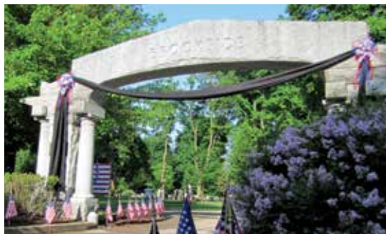
3. Brookside Cemetery 501 N. Union St.