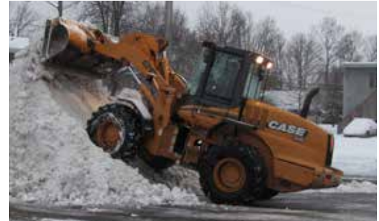
6. Department of Public Works 601 E. Cummins St.